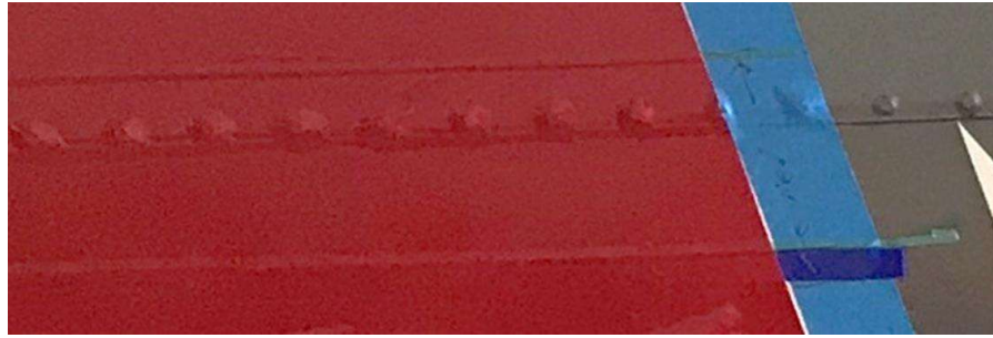
Figure 2 vinyl cutting wire partially pulled out of vinyl cutting tape.