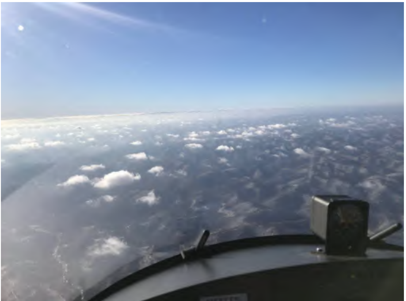
My Gyroplane flies faster above the clouds @ 5,500' with the Appalachian Mountains in the distance. The sun helped keep me warm (along with the heater on the passenger side).