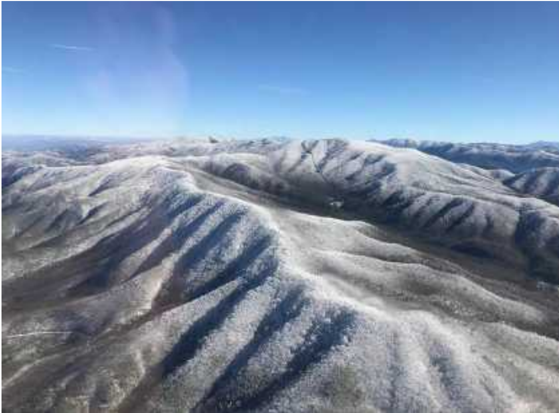
Snowy Mountains on the east side of the pass

Greeneville, TN airport is on the north side of the 2 nd mountain range near the Asheville Pass. Dropping down into the cold air between both mountain ranges – back in the 20 degree F range- so cold! Refueled and took a potty break a Greeneville then onward through the pass.