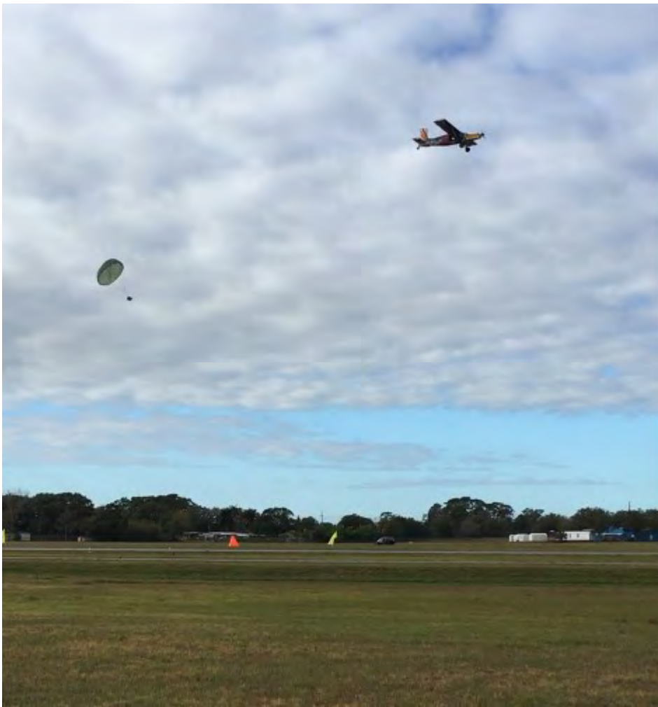
Low altitude package drop practice going on at Dunn Airpark. Wonder what they're dropping??

Arthur Dunn Airpark has been busier this January than it has been for quite a while. The exception was Jan.7 the day of our chapter breakfast. Bands of showers crossed the airport and the pancakes were special because they were sprinkled with fresh raindrops! No complaints though! Bob, Deborah and I were out there in the rain doing our cooking. No big deal cause we've been wet before!