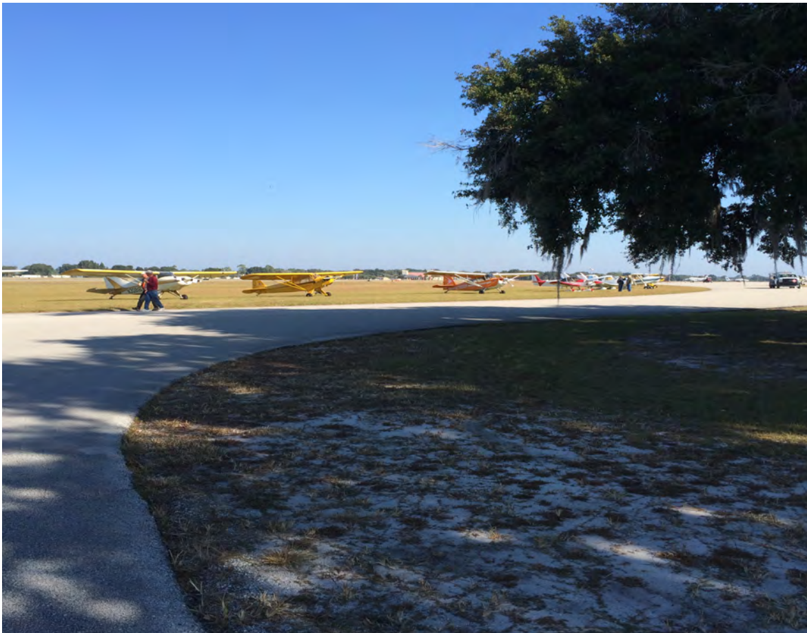
Lots of tail draggers at Winter Haven annual fly-in