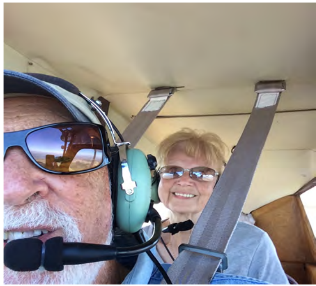
Flyin to GIF