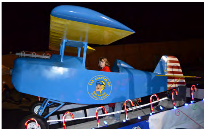
2013 Chptr 866 Christmas parade float

We'll use my truck again this year unless someone else wants to use theirs.