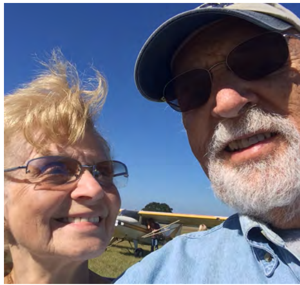
Walking around and seeing stuff