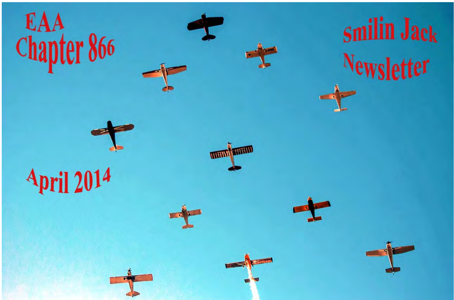
Picture is of formation flight of 11 arriving for our breakfast held on March 1