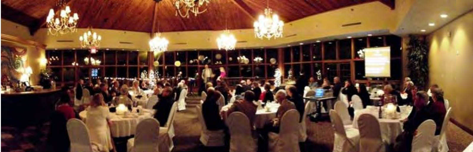
Jim Nordby shot this panorama of the party during door prize drawings.

Some of our chapter members were hard to recognize dressed up as they were!