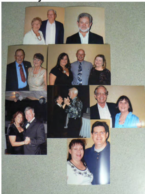
Pictures are EAA Chapter 866 members and friends all dressed up for our annual party. They're hard to recognize dressed like this. Good looking group!!