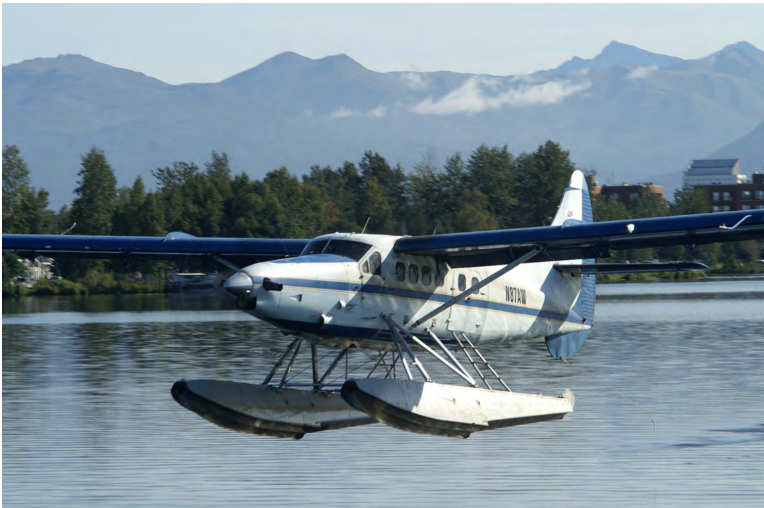
Turbine Otter departing Lake Hood seaplane base Anchorage, AK