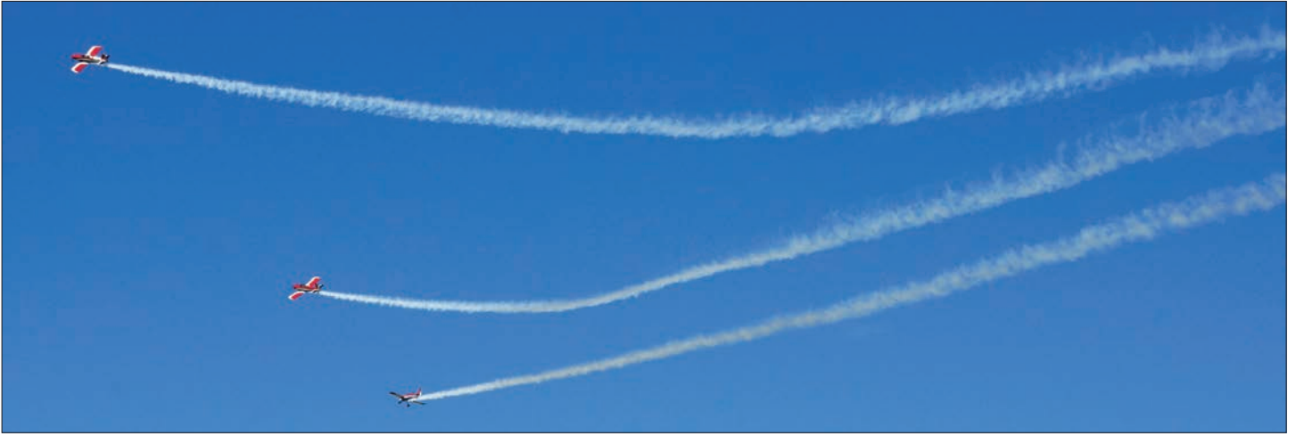
These pilots were so happy the breakfast is back they blew us some smoke