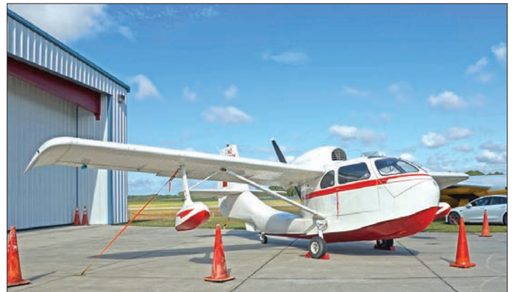
Our newly aquired Seabee

We have or will see some aircraft placement changes. The Fouga has moved to the North edge of the North driveway. The TBM will take its place clearing the North Main ramp, and the F-101 will come out to be turned around. The OV-2 will come out, and the SeaBee will go in followed by the F-101.