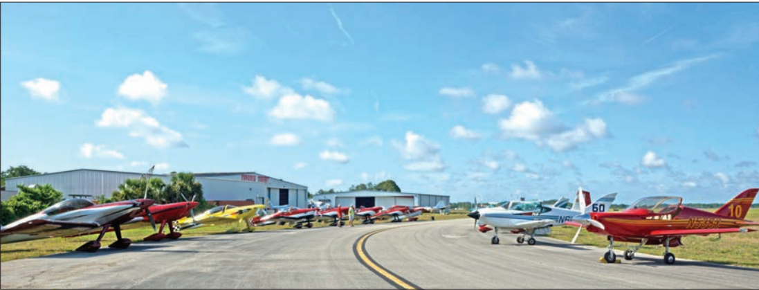
The taxiway was loaded