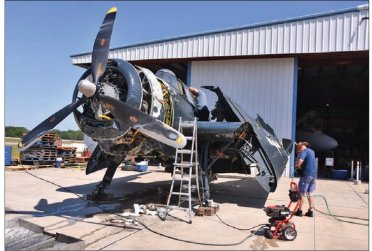
Back from the Ocean • Trying to Mitigate damage