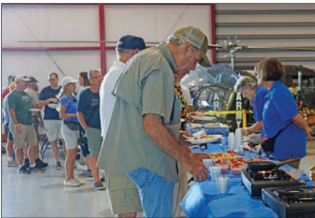
Head of the Buffet line