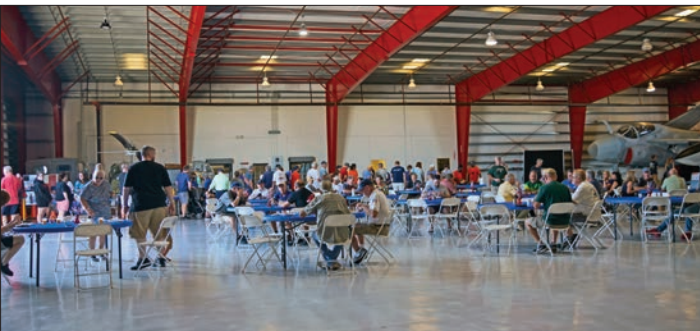
We are going to need more tables