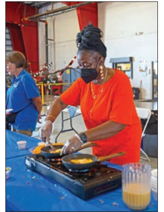
The Omelet lady