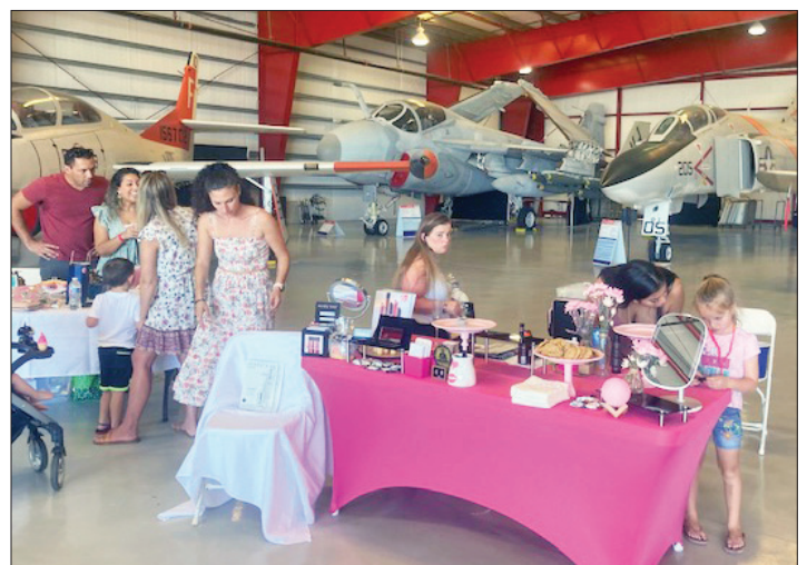
One of the many tables at the Women's Expo held in the Vietnam Hanger May 8, 2021

Valiant Air Command Museum has a new entrance look, six new 16' expandable flagpoles funded by our VAC volunteer working force. These flag poles represent the United States Armed Forces; Air Force, Army, Coast Guard, Marines, Navy, POW-MIA. The Space Command flag will replace the POW-MIA when it comes out. POW-MIA will then be flown just below the American flag.