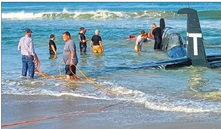
Trying to save the TBM Avenger