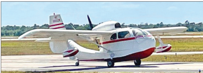
RC - 3 Seabee