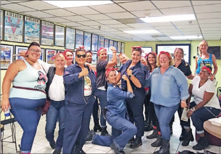
Biker Chicks enjoyed their tour of the Museum