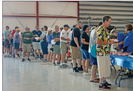
A long Buffet line