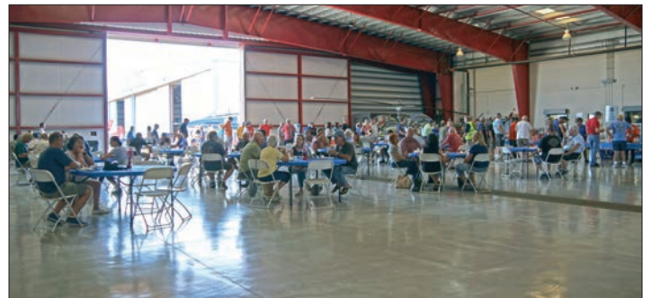
A great crowd - I think it set a record