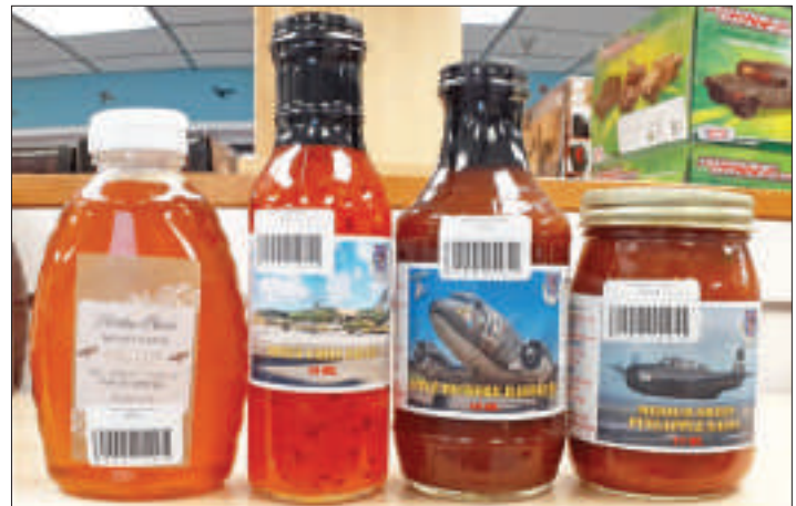
Locally Produced Food Items For Sale