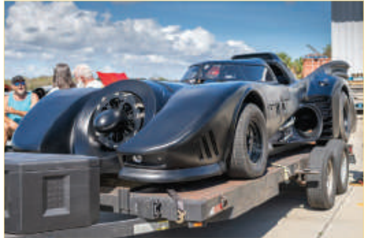
The Bat Mobile showed off its guns, electric canopy and other accessories