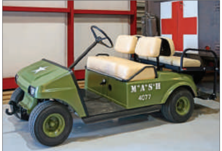
Hawkeye would have loved this

The M*A*S*H Helicopter display has a rebuilt golf cart tug