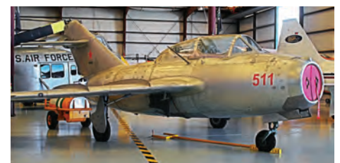
This MiG-15 is on display in our Warbird Air Museum.

Sources a.o: Aviation History on line/Boeing Historical Snapshot/The National Interest/etc.