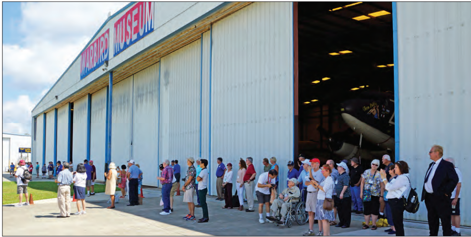
AVG Group watching the arrival of two A-10s