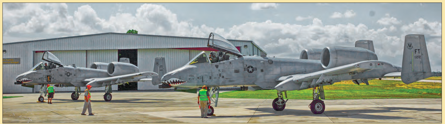
High Dynamic Range photo of the two A-10 Thunderbolts parked on the VAC ramp