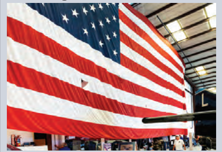
Removing the tattered and torn flag in the main hangar