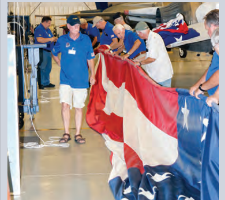
It is very hard to fold a giant flag