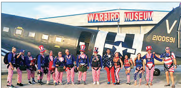
Tico Belle, once again, transported these jumpers to the beach on the Fourth Of July