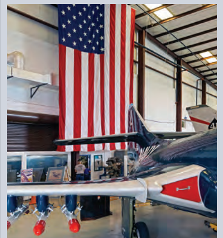
The new donated flag is up and really looks great