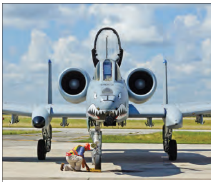
Chocking the A-10