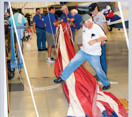
Don't step on it!!!