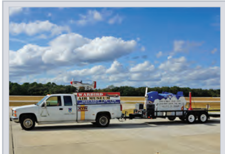
The VAC float is almost ready to participate in the Titusville Christmas Parade