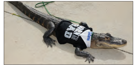
Anyone missing an alligator?