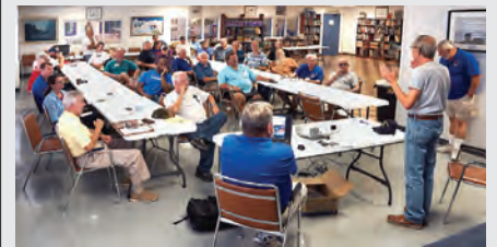
11-5-2016 Tour Guide Meeting

At some point, we seemed to have lost our focus on how and why our organization started and what we are all about. We actually did start as a form of "flying club" with our original members being pilots and mechanics continued on page 4