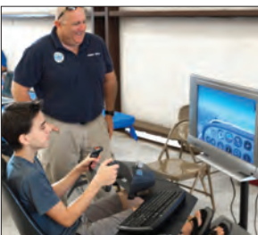
Fly the simulator.