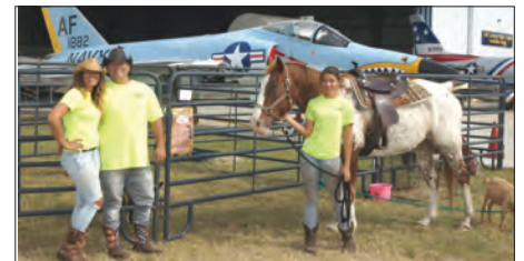
Petting zoo & horseback rides.