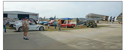
As advertised...planes, trains and cars.