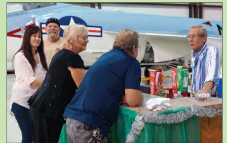
The place to be at the party.