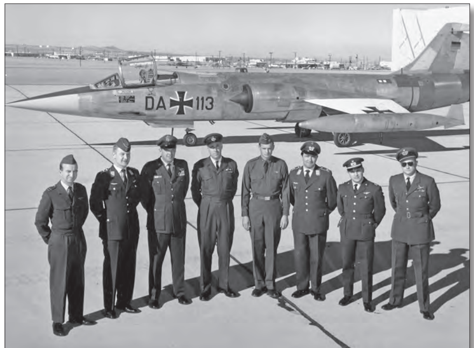
F-104G JTF, Edwards Air Force Base -1961