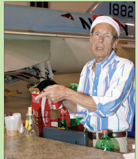
Honestly Norm, I didn't see the tip jug. :<))