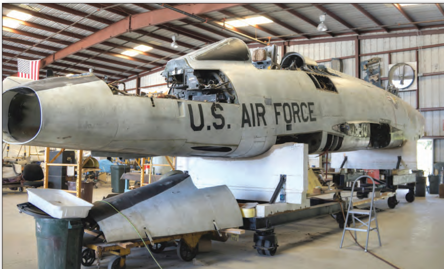
Our F-100 Super Sabre in the restoration hangar.

Respectfully, Eli E. White, D.D.S. AOPA No. 00258859 drelir@aol.com. Cell 321 543 1230