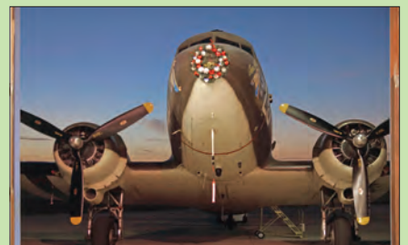
I want to come in and join the party.