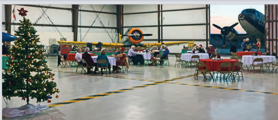
All set-up, just waiting for the rest of the people so we can start the party

Mar 8-9 TICO Formation Clinic - Mar 10-12 TICO Warbird AirShow