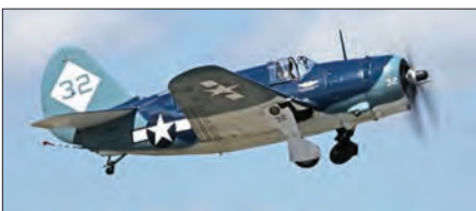
This very rare SB2C Navy Helldiver flew in our show