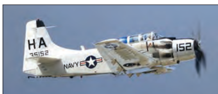
A-1 Skyraider shows off in a photo pass for the crowd