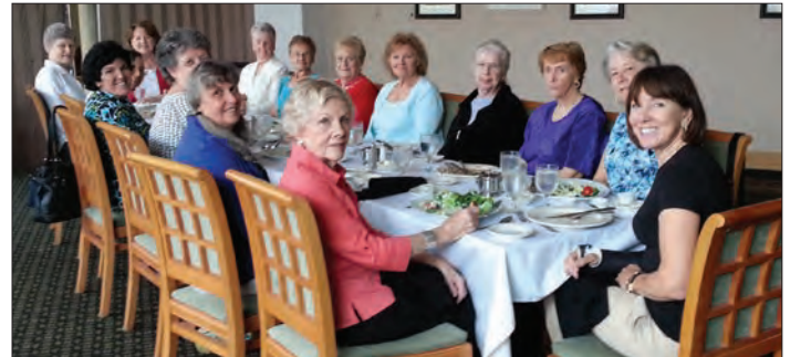
The V.A.C. Volunteer Ladies enjoyed lunch at La Cita Country Club courtesy of the restoration guys