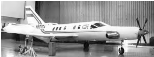
The Gulfstream American "Hustler"

to regain some portion of powering the aircraft and at that point the handling of the aircraft became very difficult to control as I increased speed during my let down to the landing pattern. Lowering the landing gear and flaps created some very strange changes in the control forces. I performed some energetic exercises which finally allowed me to reach the touchdown on the runway. I really wasn't sure if the aircraft controlled me or I controlled the "Hustler".