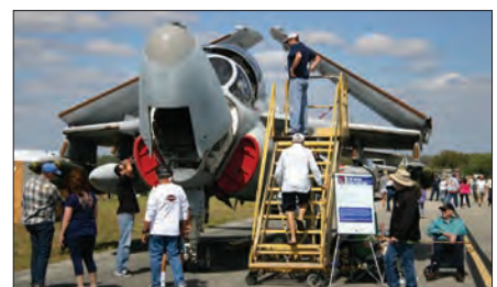
Our A-6 Intruder sits on the static line open for inspection