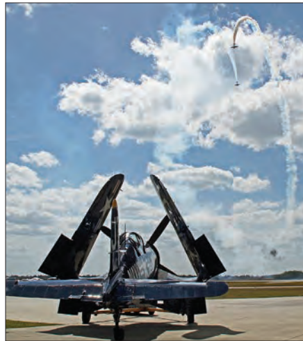
Jim Tobul's F-4U watches the airshow waiting to perform