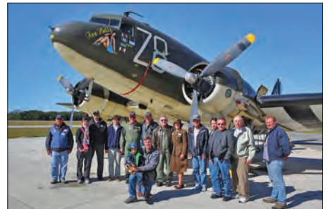
1/18/14 12 pm Passenger flight