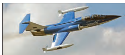
Rick "Comrade" Svetkoff flying the F-104 StarFighter