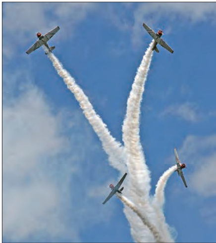
The Geico Skytypers perform the star burst