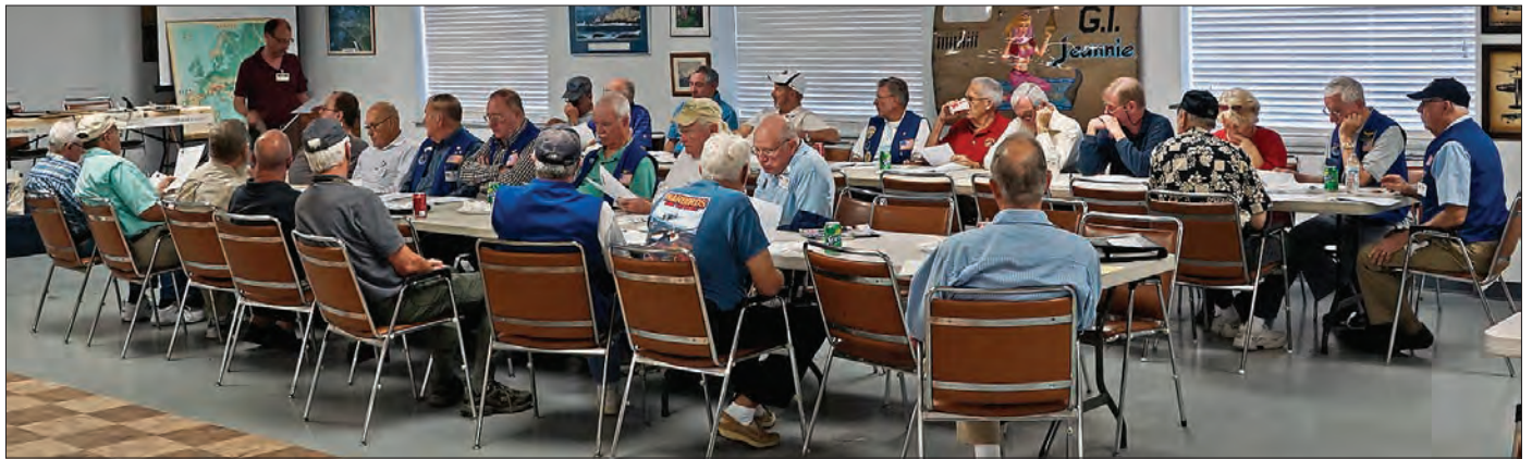
3-1-14 AirShow Info & Safety Meeting For The Tour Guides