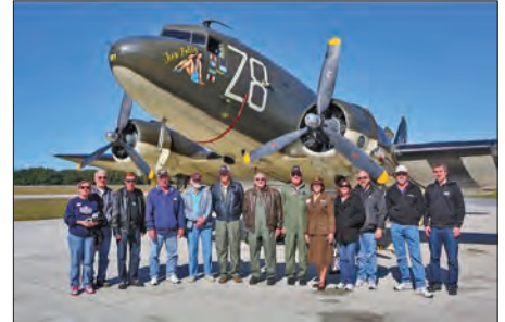
1/18/14 10 am Passenger flight