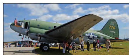
"Tinker Belle" was a very popular static display