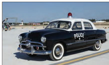
Do you remember when this Ford was the best available?