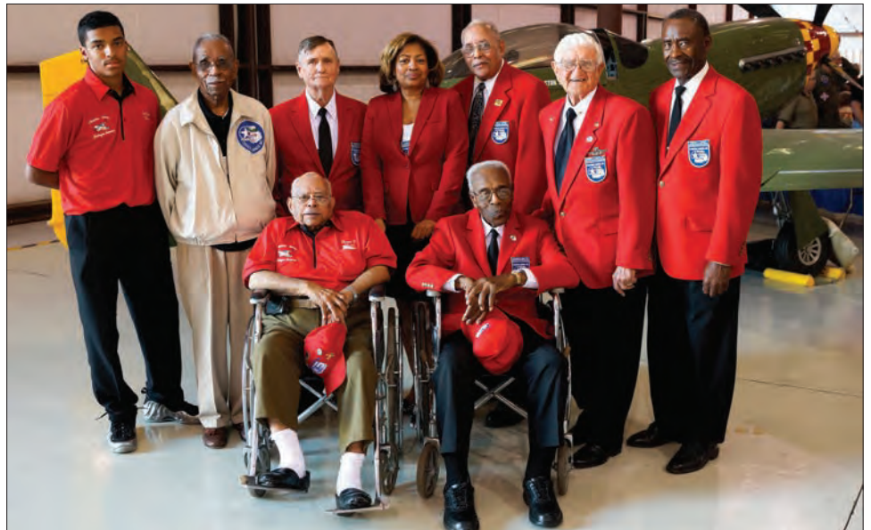
3 original Tuskegee Pilots and friends at the VAC Member,s Dinner