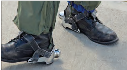
What the well dressed F-104 pilot wears on his feet