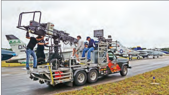
Above: Emory University Hospital (Atlanta, GA) commercial film shoot at the V.A.C. Below: VAC Warbirds lined up for the shoot