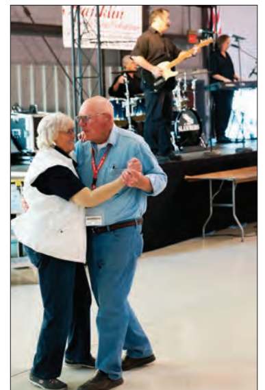
And dancing too!