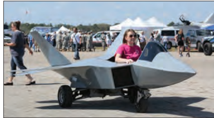
Dept. of Defense is testing their newest attack aircraft