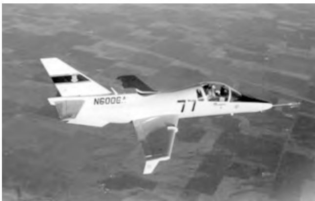
The Gulfstream American "Peregrine"

I never had any desire to fly that machine again and as far as I know it has never flown since that flight of mine. I did learn that an engine mounted in the tail of the aircraft; with the proper design and placement of the intake could work quite well as was later proven by the "Peregrine".