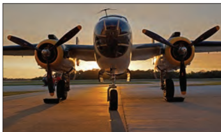
This was our view as we ate at the Member's Dinner