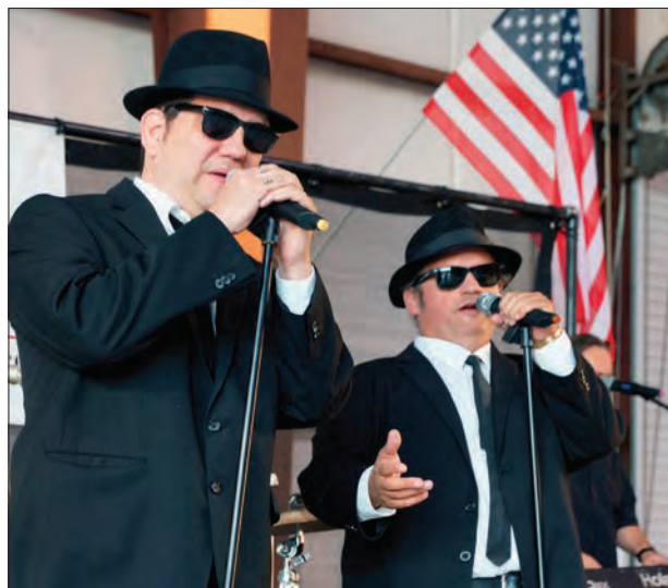
The Blues Brothers entertain the Annual Member's Dinner attendees