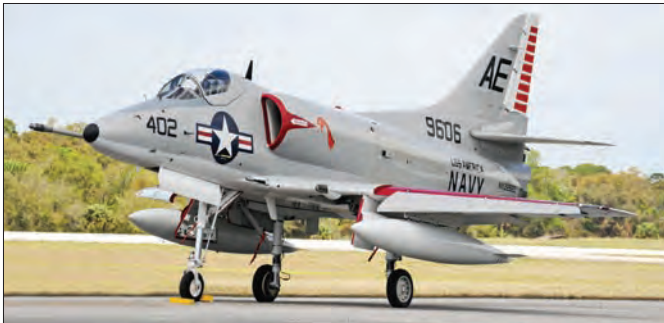
A flying A-4C Skyhawk is now on permanent display in the Vietnam Hangar at V.A.C.