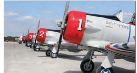
The six Geico Skytyper's SNJs await their turn to fly