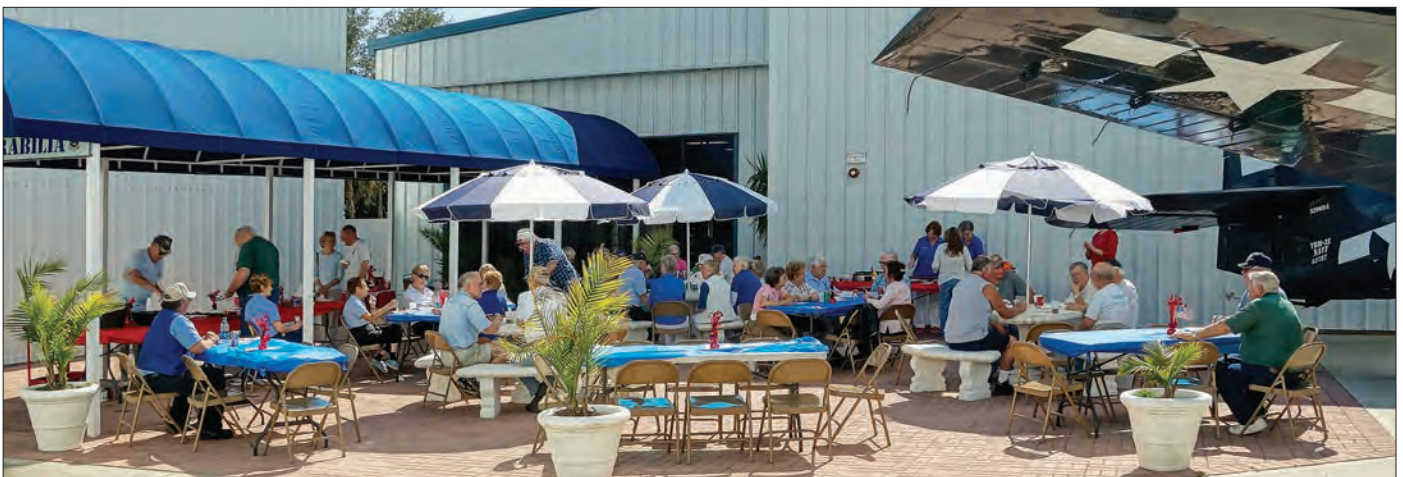
Valentine's "Hot Dog" Day was enjoyed by all