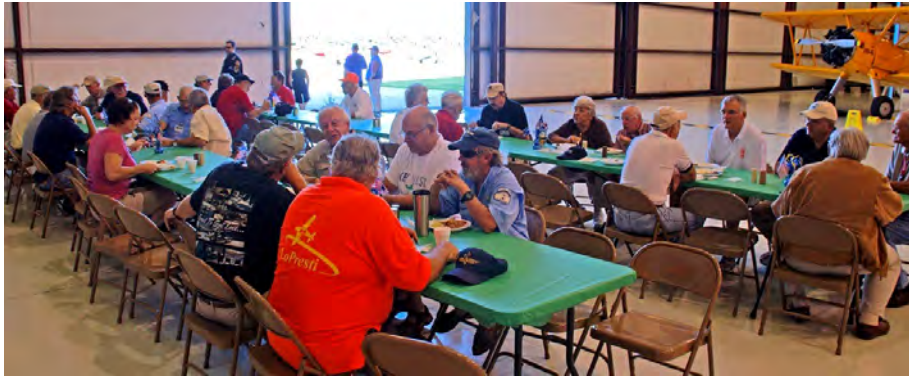
Fly-In Breakfast—enjoyed by Walk-Ins too!!

HIGHLIGHTS FROM OCTOBER, NOVEMBER & DECEMBER 2012