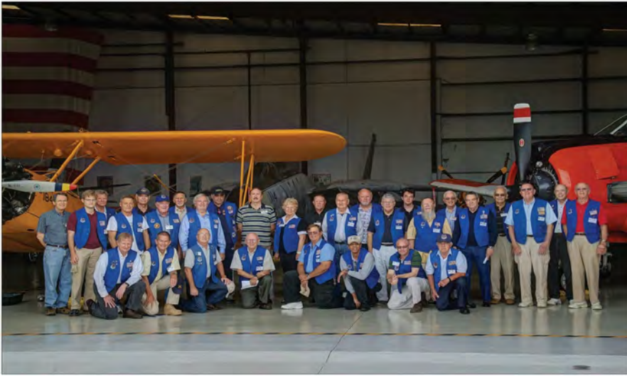
01 December 2012 Tour Guide Meeting.