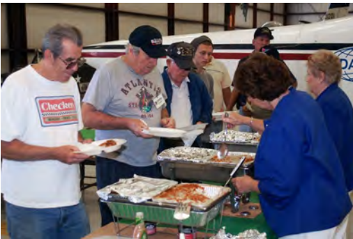
After a time of decorating, hungry volunteers enjoy lunch! from Kelsey's served by our volunteers.