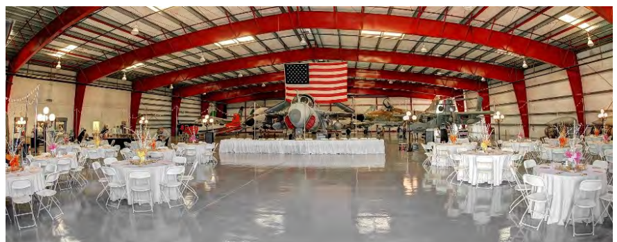
A beautiful set-up for a wedding in our Vietnam Hangar!