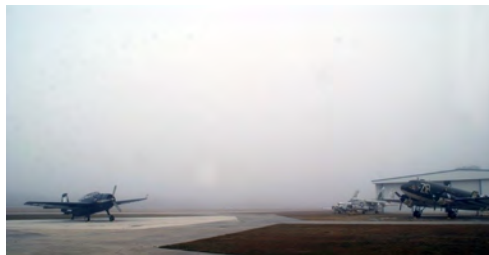
The foggy weather prevented the usual crowd from flying in for our December Fly-In Breakfast!