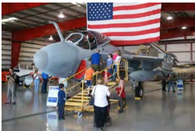
Visitors enjoyed a close up of the A-6!