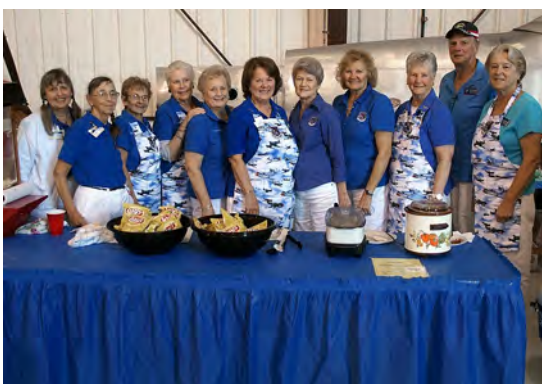
Veteran's Day Open House Volunteers at the Hot Dog Stand.