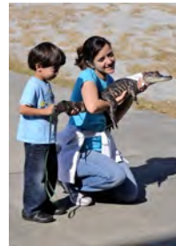
Jungle Adventures brought an alligator for all to admire.