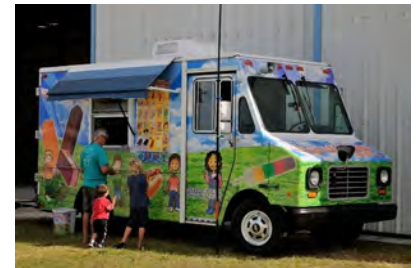
Mr. J's Ice Cream truck is always a hit by young and old alike!