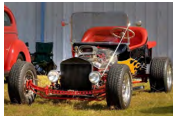
Antique Cars were on display to enjoy!