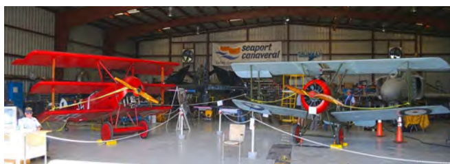
The "Red Baron and Snoopy" on display for Veteran's Day!