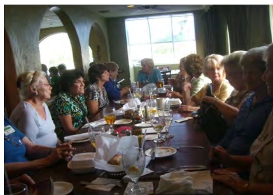
Our volunteer ladies enjoy a luncheon out at Portofino's Restaurant.