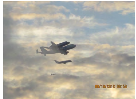
Ron Lyons captured this beautiful photo of Endeavour departing for California 19 Sep 2012.