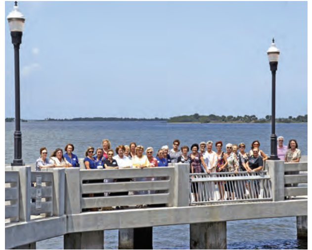
Ladies Day Out 26 April 2011 at Crackerjacks in Titusville.