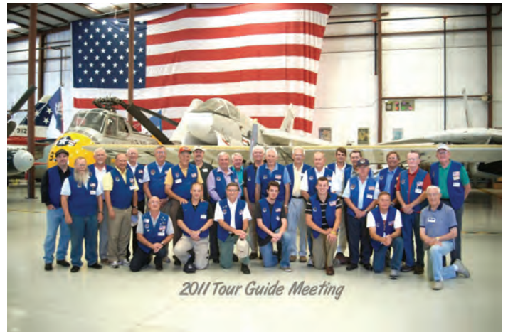
2011 Tour Guide Meeting