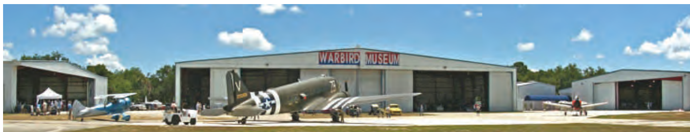
Now there are three!