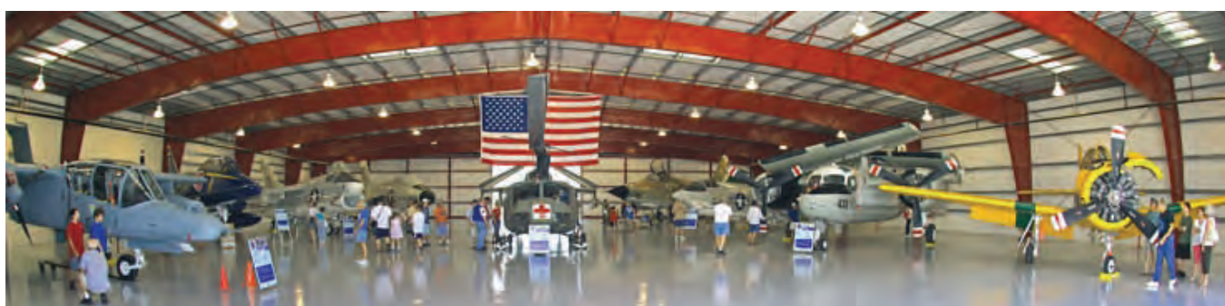
A New Home for our Vietnam Aircraft and Memorabilia!