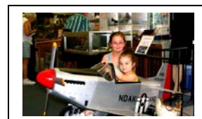
Future VAC Pilots! Thanks for visiting our Memorial Weekend!