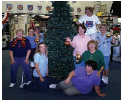
Volunteers decorating for Christmas