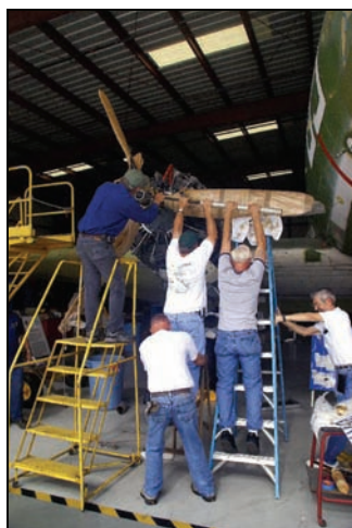
Left prop installed like clockwork!