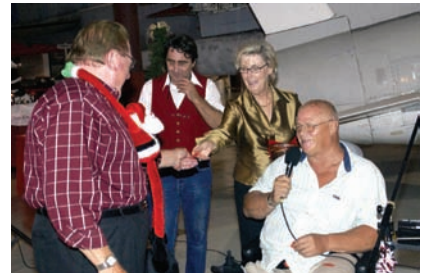
Door prizes were a big hit!