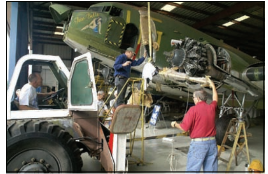
Right prop moves into place!