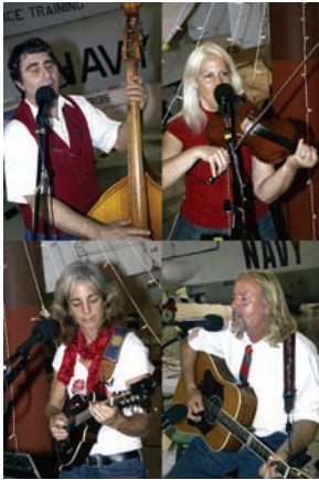
Good Time N' Band performs for VAC members enjoyment!

Official Bulletin of the Valiant Air Command February 2008