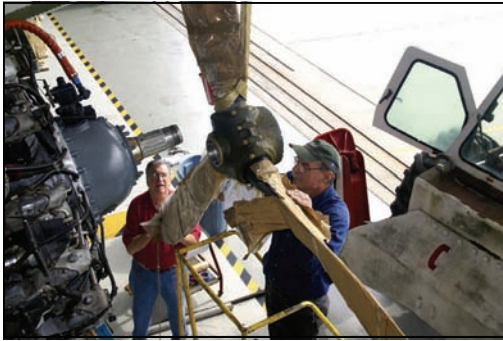
Hoist lifting prop in place!