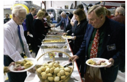
Christmas Dinner begins!!!