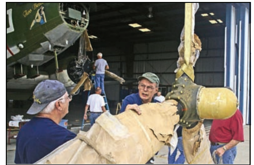
How do you install this prop anyway!