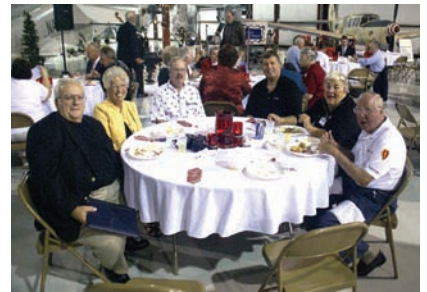
VAC members enjoying dinner!