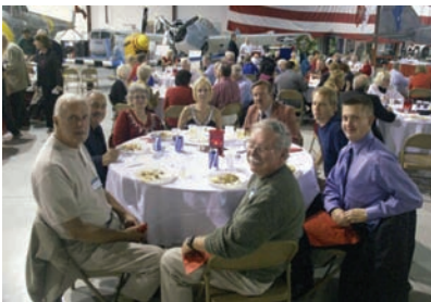
Air America members join the fun!