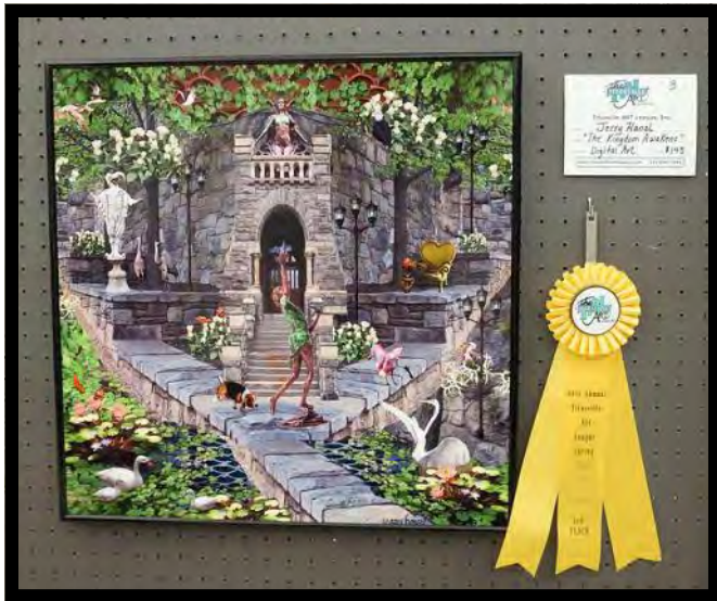
3rd Place Photography Jerry Hanzl (left)