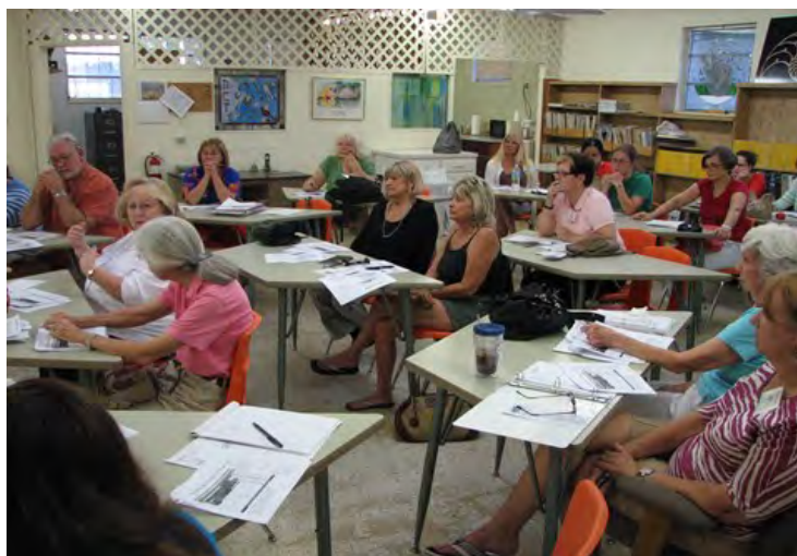
TAL members listening in rapt attention.