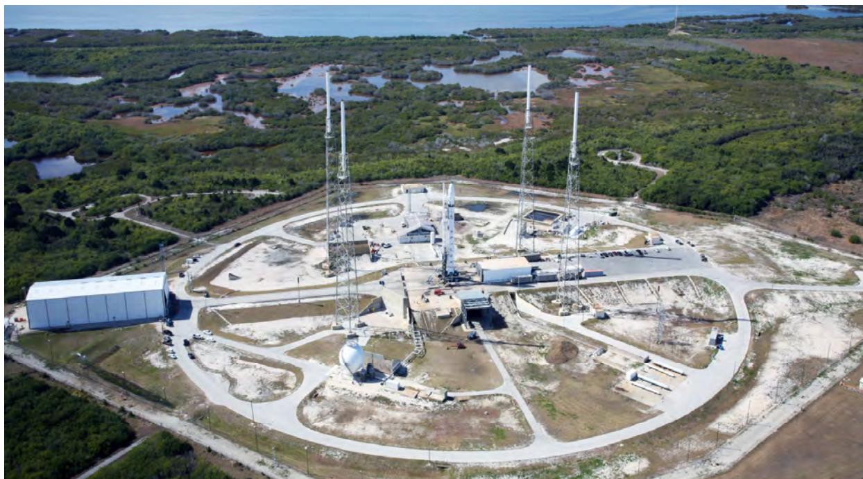
View looking west, showing SpaceX's Space Launch Complex 40 launch site, Cape Canaveral Air Force Station, with the Falcon 9 Flight 1 vehicle on the launch pad at the center.

The Falcon 9 launch site at Space Launch Complex 40 (SLC-40), on Cape Canaveral Air Force Station (CCAFS), is located on the Atlantic coast of Florida, approximately 5.5 km (3.5 miles) southeast of NASA's space shuttle launch site.