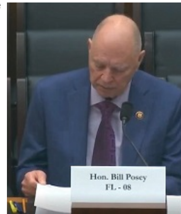
Rep. Posey testifies before the House Appropriations Committee for strong funding for our National Estuary Program.

The PFAS Action Act will mobilize a muscular response to PFAS under the Comprehensive Environmental Response, Compensation and Liability Act — it accelerates drinking water regulations, and provides robust funding to address and remediate PFAS impacts. The legislation builds on progress made in this year's National Defense Authorization Act, which prohibited the use of PFAS containing firefighting foam on military bases. Last year Rep. Posey worked with residents and the Army Corps of Engineers to officially designate South Patrick Shores a Formerly Used Defense Site – a major step in remediation and fighting contamination.