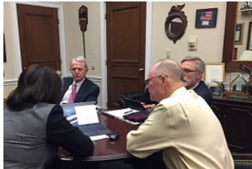
Rep. Posey meets with the House Clerk to discuss implementing a new House rule he authored to make legislation easier for the public to read and understand.