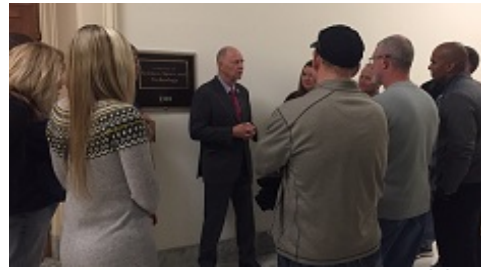
Rep. Posey talks space issues with KSC workers visiting Washington.

The future of American space launch companies is threatened by increased subsidies from foreign governments. This harms American workers and U.S. companies, and it undermines our national security.