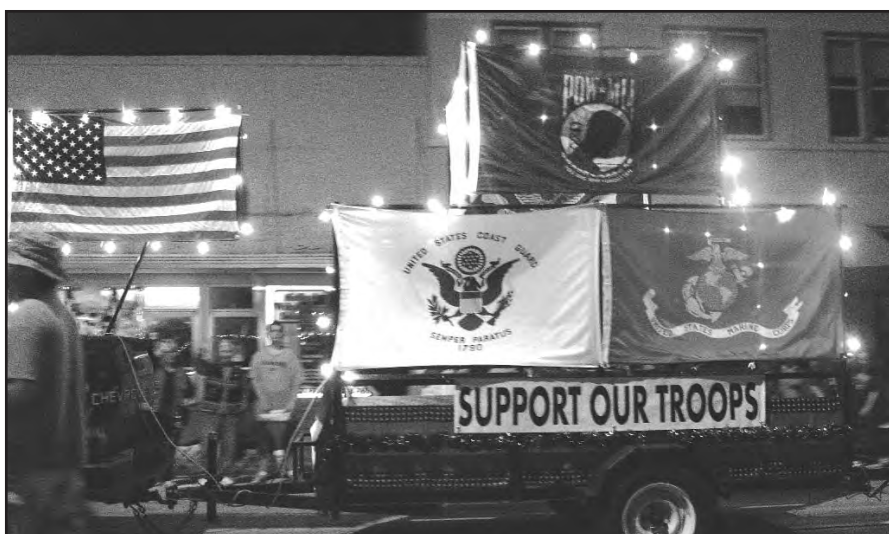
Top, crowds cheered for the Titusville High School Band as they played various Christmas favorites. Bands from Jackson and Madison Middle Schools, as well as Astronaut High Schools marched the parade route. Left, some floats you just don't mind seeing again and again every year. No matter where you stand on the route, people always salute, stand and clap for the Support Our Troops display.