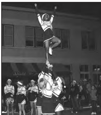
Right, the crowd's favorite gets funnier every year in the Titusville parade. The hillbillies were hunting a remote-controlled skunk. They must have been a poor shot because they kept firing at it, which made people and their pets jump. They should have lassoed the skunk with those large panties. Left, the Astronaut High School cheerleaders stopped downtown to show the crowd their aerial prowess and flexibility. Below, Girl, Boy and Cub Scouts were out in full force.