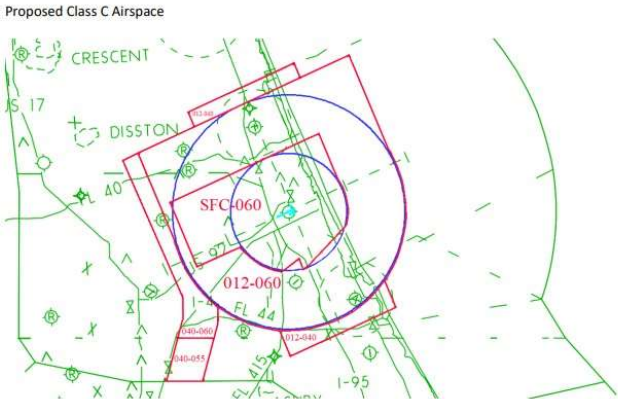
Proposed Class C, top 6,000'!