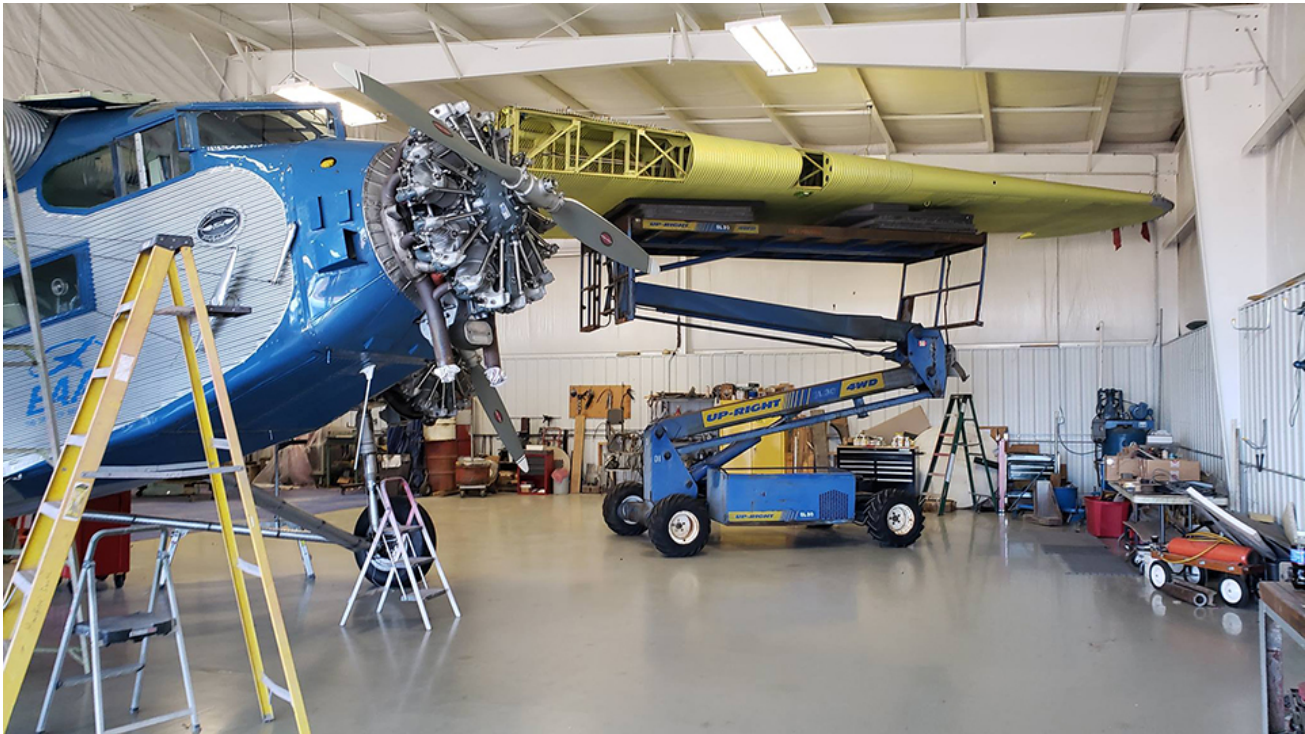
The effort to replace the wings on the EAA 4AT Tri-Motor is progressing nicely.

https://www.eaa.org/en/ea/news-and-publications/ea-news-and-aviation-news/news/03-07-2019-Keeping-EAAs-Ford-Tri-Motor-in-the-Air-Tin-Goose-Alert