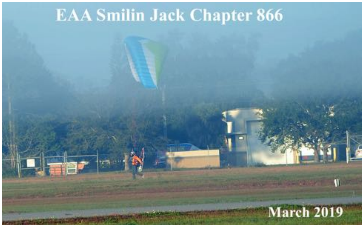
Dunn Airpark early morning Power Chuter

Greetings Members and Friends of EAA Chapter 866,