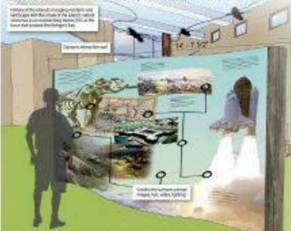
Exhibit L: "Our Past, Present, and Future"

We welcome anyone who would like to make a donation or volunteer their time to this wonderful project. Contact us at habichat@merrittislandwildlifeassociation.org or via our website at www.merrittislandwildlife.org