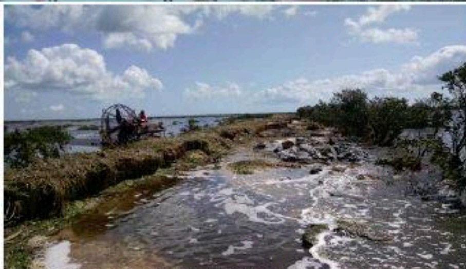
Hurricane Irma sent flood waters scouring over many of the Refuge levees. Early assessments indicate that at least 12 miles of levees are severely eroded. The Peacocks Pocket Levee was the hardest hit. It is closed to all access.

Check out page 2 for more details and RSVP form for this year's event. We look forward to seeing you there!