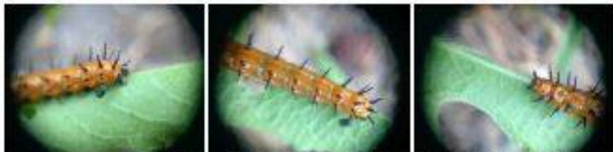
Gulf fritillary, Agraulis vanillae (Linnaeus) caterpillar.

The Refuge is in need of volunteers to help with our Butterfly Survey program. Volunteers meet once a month (generally on the first Saturday) in the MINWR Visitor Center auditorium. The program begins with a photo presentation on learning how to identify butterflies. Afterwards, everyone participates in a butterfly survey to collect data for the North American Butterfly Count and Florida Butterfly Monitoring Network. The survey takes place over different locations on the Refuge and volunteers meet back at the Visitor Center in the afternoon to turn in their data. Be sure to bring water, snacks, insect repellent and wear closed shoes and long pants. For more information, please call the refuge at 321-861-0669. The next survey is scheduled for Saturday Oct. 7 th at 9am.