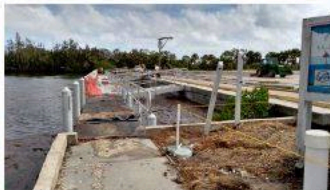
Bairs Cove boatramp being evaluated after Hurricane Irma