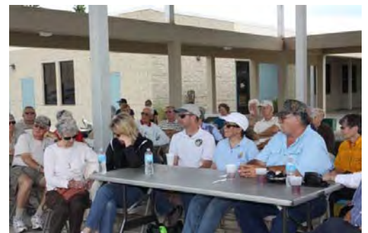
Volunteer recognition at Marine Discovery Center

Fifty plus volunteers enjoyed a day filled with marine science activities and an enjoyable meal sponsored by MIWA at the Marine Discovery Center for the Refuge's Annual Volunteer Recognition. The Marine Discovery Center located in New Smyrna is a non-profit environmental education organization offering a bounty of educational opportunities for adults and kids. Our volunteers enjoyed viewing the aquatic displays including a touch tank at the visitor center, admired and learned about our precious Indian River Lagoon on a pontoon boat ride, learned about the natural history of our local seashells ( mollusks), and got up close and personal with earth worms.