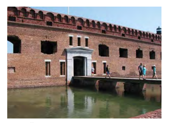
Fort Jefferson