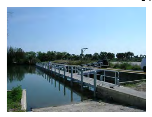
Improved Bair's Cove Boat Ramp

They say the one constant in life is change. In this case, the change is good and, over the last several months, the Refuge was pleased to replace two old facilities, which will benefit staff and visitors. In May, we saw the completion of a new 2,000 sq ft, six-office building that was constructed with Stimulus Funding. The new building will house the biologist, law enforcement, and maintenance staff, and is located next to Headquarters. This building will replace the triple wide trailer which was obtained from NASA about 10 years