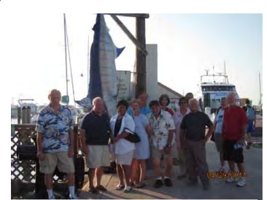
MIWA Tour Group Dockside