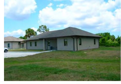
New Refuge Office Building

In April, a new 200' long dock at Bairs Cove Boat Ramp was completed. The dock replaces a 50' dock that has been in use since the