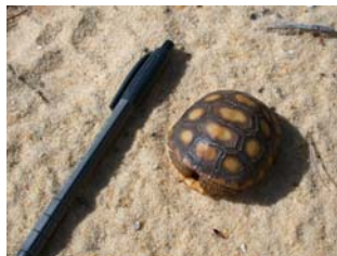
A young gopher tortoise compared with ball-point pen.

The most important thing to consider is that gopher tortoises and their nests and burrows are protected by state and federal laws and they should not have their daily lives disrupted in any way. NEVER move a tortoise to a new location. This can harm the tortoise that is moved and can be detrimental to any existing tortoises that already inhabit the site. If you see one attempting to cross the road and you can safely move it, please take the tortoise in the direction it is going, otherwise it most likely will return to the road. It is okay and a lot of fun to observe gopher tortoises in their natural habitats.