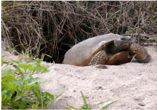
Gopher tortoise ( Gopherus polyphemus ) emerging from its burrow.