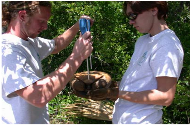
A gopher tortoise being measured before tagging and release.

Come volunteer and help with projects like the gopher tortoise census, burrow surveys, mapping and tortoise tagging.